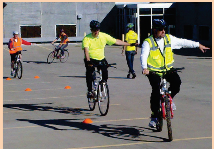
Bike Ed Class with MoDOT staff

In the next 5 years, we will reduce the rate of pedestrian and bicycle crashes and injuries per trip around Missouri by one third. We will promote and encourage motorist education programs and activities and work with law enforcement to encourage appropriate enforcement activities to promote safety for all road users.