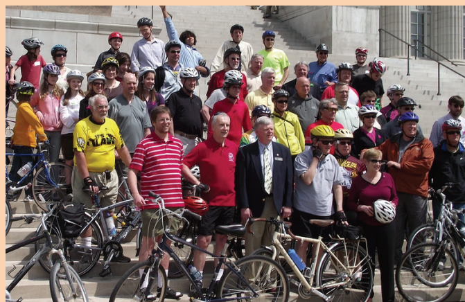
Capitol Day in Jefferson City

In the next 5 years, we will gather thousands of active members from every part of the state of Missouri and work together to create a new movement in support of bicycling and walking. We will build partnerships and coalitions with like-minded organizations to expand our influence.