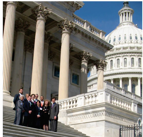
Missouri delegation to the National Bike Summit

🚲 Three annual special events help support our advocacy mission: We now have two bicycle rides and a run that successfully raise funds and awareness for our advocacy mission. In 2014, these events will provide the same level of support as a federal Safe Routes to School Grant would—at a fraction of the cost in administration and overhead.