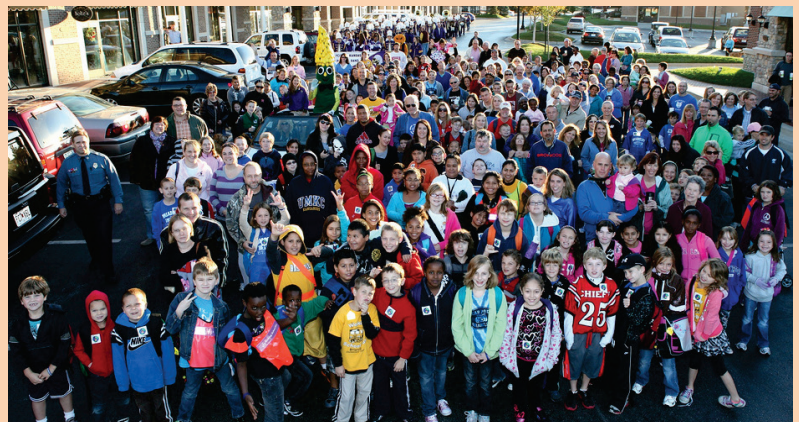
Walk to School Day at Briarcliff Elementary, October 2011

In the next 5 years, we will promote, encourage, and conduct programs and campaigns throughout the state that increase active transportation for all users. We will help communities develop and implement these efforts.