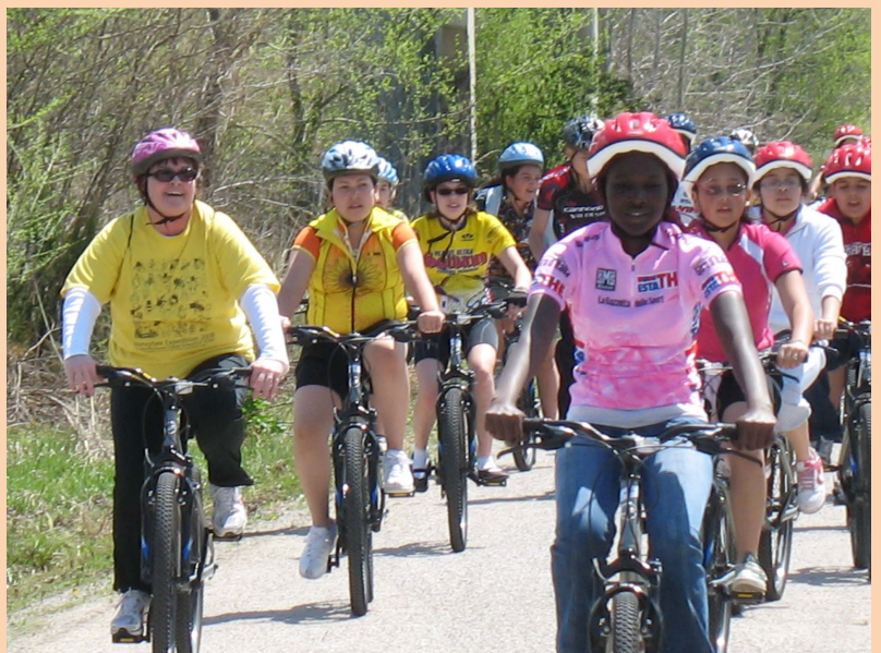
Katy Trail Ride with Missouri Legislators, April 2010

In the next 5 years, we will gather thousands of active members from every part of the state of Missouri and work together to create a new movement in support of bicycling and walking. We will build partnerships and coalitions with like-minded organizations to expand our influence.