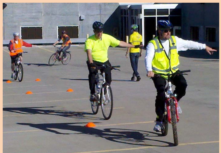
Bike Ed Class with MoDOT staff, November 2010

In the next 5 years, we will reduce the rate of pedestrian and bicycle crashes and injuries per trip around Missouri by one third. We will promote and encourage motorist education programs and activities and work with law enforcement to encourage appropriate enforcement activities to promote safety for all road users.