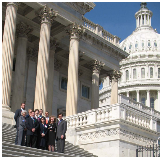
Missouri delegation to the National Bike Summit

Thanks to your support, we have seen a clear increase in the number of bicycle and pedestrian friendly platform planks passing into law: two from 1995-1999, one from 2000-2004, and 22 from 2005-2010.