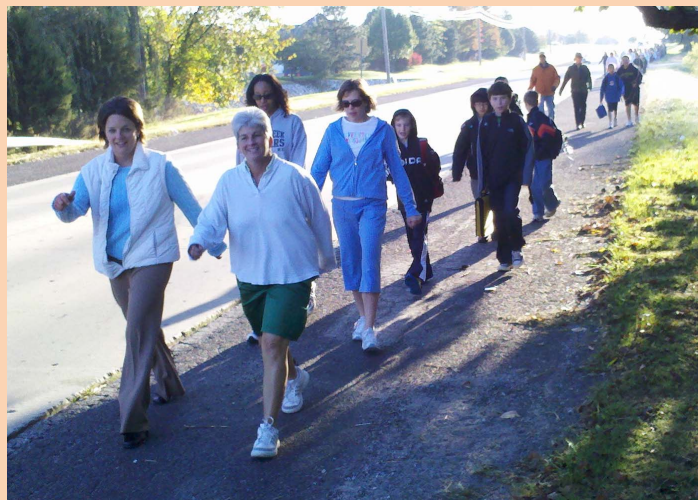
Walk to School Day, October 2010

In the next 5 years, we will promote, encourage, and conduct programs and campaigns throughout the state that increase active transportation for all users. We will help communities develop and implement these efforts.