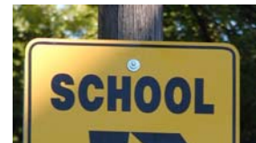
London, ON - Clearly marked school routes show due diligence by marking the best routes to school