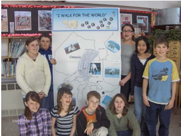
Laird Central School – Children pose with IWALK poster

Ontario curriculum has responded to growing health and environment concerns, as demonstrated by the mandate for 20 minutes of Daily Physical Activity, the Healthy Schools Recognition initiative, a growing movement towards EcoSchools initiatives, and new directives in environmental education.