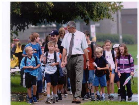
Children walk to school with their principal on IWALK day

As a response to the growing need for a strategy based on these goals, Green Communities Canada (GCC) has worked extensively with the Centre for Sustainable Transportation to create and promote the Child and Youth Friendly Land Use and Transport Planning Guidelines for Ontario (see www.kidsonthemove.ca ). According to these Guidelines , the needs of children and youth should receive as much priority as the needs of people of other ages and the requirements of business when it comes to land use and transport planning. The Guidelines and the School Travel Planning (STP) model work hand in hand to create opportunities for safe, active travel to and from school.