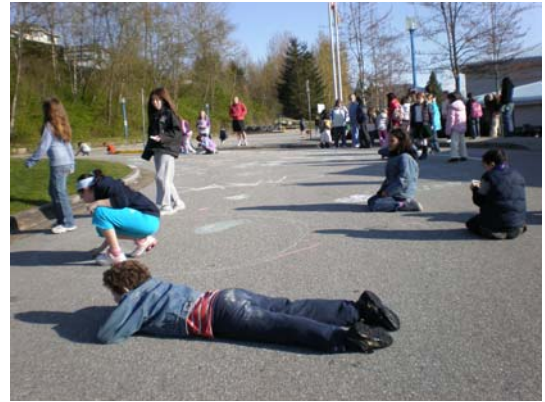
Celebrating Earth Day – children drawing and playing safely on a parking lot closed to traffic

Paving companies typically charge $3 - $4 per square foot for the paving costs alone – the costs of tree removal, leveling, drainage, city sewer hookup and site plan approval would be additional and add up to hundreds of thousands of dollars per job. 18 As an example, Park View Education Centre in Nova Scotia received long-awaited funds in the spring of 2009 to build a new parking lot intended to alleviate traffic congestion at the high school that serves 869 students. 19 The estimated cost for the parking lot overhaul is $250,000. 20