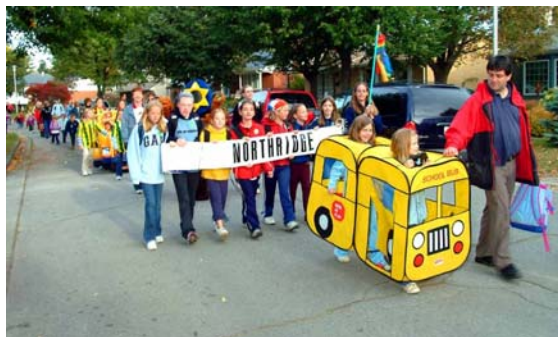
London – This Walking School Bus can help eliminate the need for school buses

While different boards of education have varying safety and age concerns that dictate the walkable distance from the school, it is possible that refinement of the board-approved walking distances can