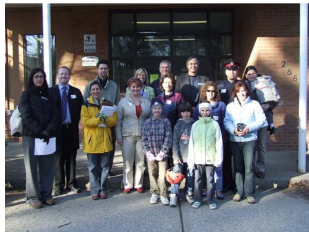
Halton Region’s Maple Grove STP Committee – bringing the community together for School Travel Planning

Infrastructure changes and / or additions that contribute to more walkable, safer routes to school benefit the entire community by building the capacity for all residents to use active transportation for short trips. Getting more people on the streets walking and cycling to local destinations contributes to a sense of connectedness and increased quality of life. As ASRTS programs have proven, collaboration among community agencies towards support of active school travel choices also increases the connectivity of communities by showing citizens that agencies can work together toward similar goals. Collaborative work among agencies also raises the profile of important issues that affect the community. When ASRTS programs bring agencies together to talk about active school travel, the whole community understands the profound importance of tackling health, safety, environmental and economic issues surrounding transportation culture.