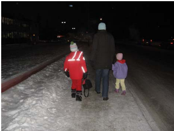
Yukon – reliable clearance of snow from sidewalks ensures safer routes for children choosing active travel in winter

Snow removal from Ontario school parking lots is covered by District School Boards and so the cost is rarely observed or scrutinized by the schools that need it. It would be interesting to know just how much money is spent clearing snow from lots and lanes built to accommodate children driven to school, but this data is not currently available. If schools had less paved space, this cost could clearly be reduced.